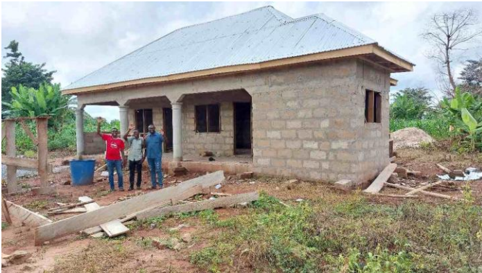
The new DC under construction

In the village of Kyeradeso in the Nkoranza-South District, we are currently building a beautiful new Daycare, replacing the temporary and too-small facility in an old classroom.