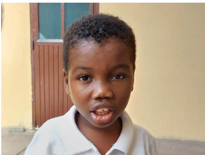
The 3 rd new PCC resident, coming from OCH (see page 1)