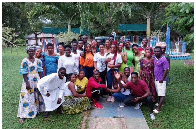
29 th September: 8 th Caregivers Day