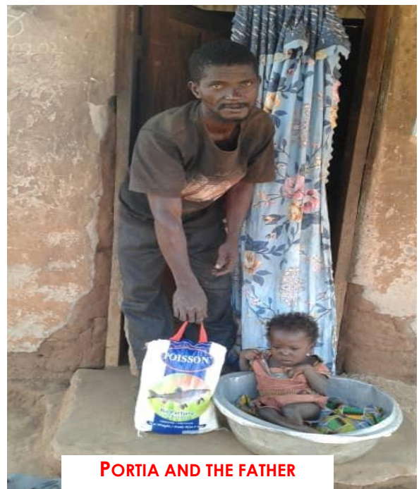
PORTIA AND THE FATHER

During the period under reporting, we distributed rice to our clients. We were not able to add oil this year due partly to the escalating price increases of goods on the market and also the increase in the number of beneficiaries.