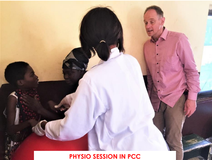
PHYSIO SESSION IN PCC

During the second quarter of the year, the outreach team in consultation with the executive board