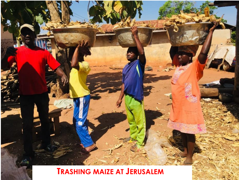
TRASHING MAIZE AT JERUSALEM

During the first quarter of 2022, the outreach team acquired a one-acre land at Jerusalem for the cultivation of maize. The team met with parents and their wards to discuss and subsequently ploughed and planted the maize.