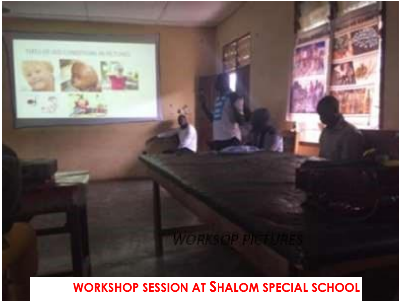
WORKSHOP SESSION AT SHALOM SPECIAL SCHOOL

On 30th June 2022, the outreach team in collaboration with the management of Shalom Special School, organized a one-day training workshop for newly posted teachers and the non-teaching staff. The purpose of the workshop was to give the participants basic insight and knowledge about what constitute intellectual and developmental