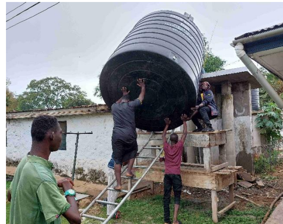
Quite a challenge indeed, just look....

Walls and paths are collapsing, and also overhead water tanks can't last forever. Our large tank was leaking more and more, but thanks to a generous donation and lots of efforts, it has been replaced with a robust new tank.