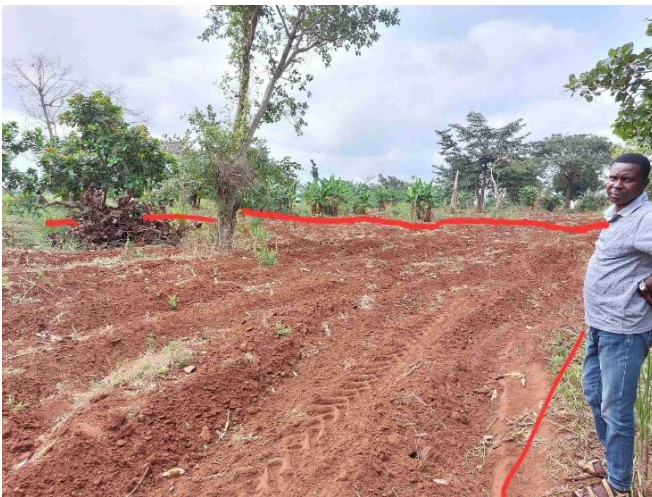
Joe Emma at the new plot for the DC

Currently, four Daycare centres are active. In the village of Kyeradeso, we recently purchased a plot of land to build a new DC, as we are currently residing there in temporary housing. Construction will begin early 2026!