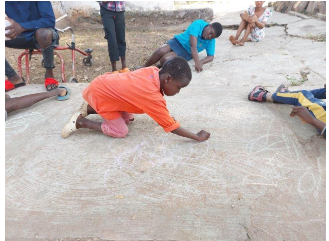
The paths in PCC are also perfect for sidewalk chalk art!