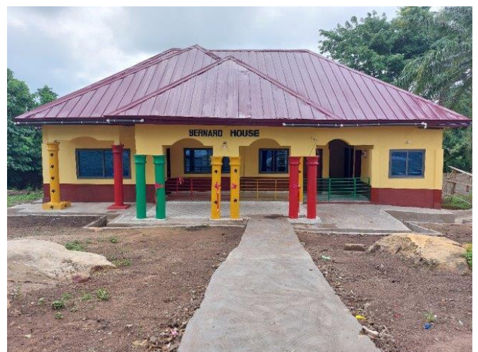
The big new Dormitory Bernard House