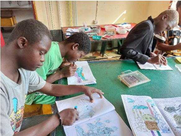
Enjoying the Sheltered Workshop

This sector helps the workshop to generate extra income for PCC by producing a wide variety of products, including various types of bags, aprons, placemats, purses and picnic cloths. These products are very much appreciated by the visitors of our PCC shop as well as by clients overseas.