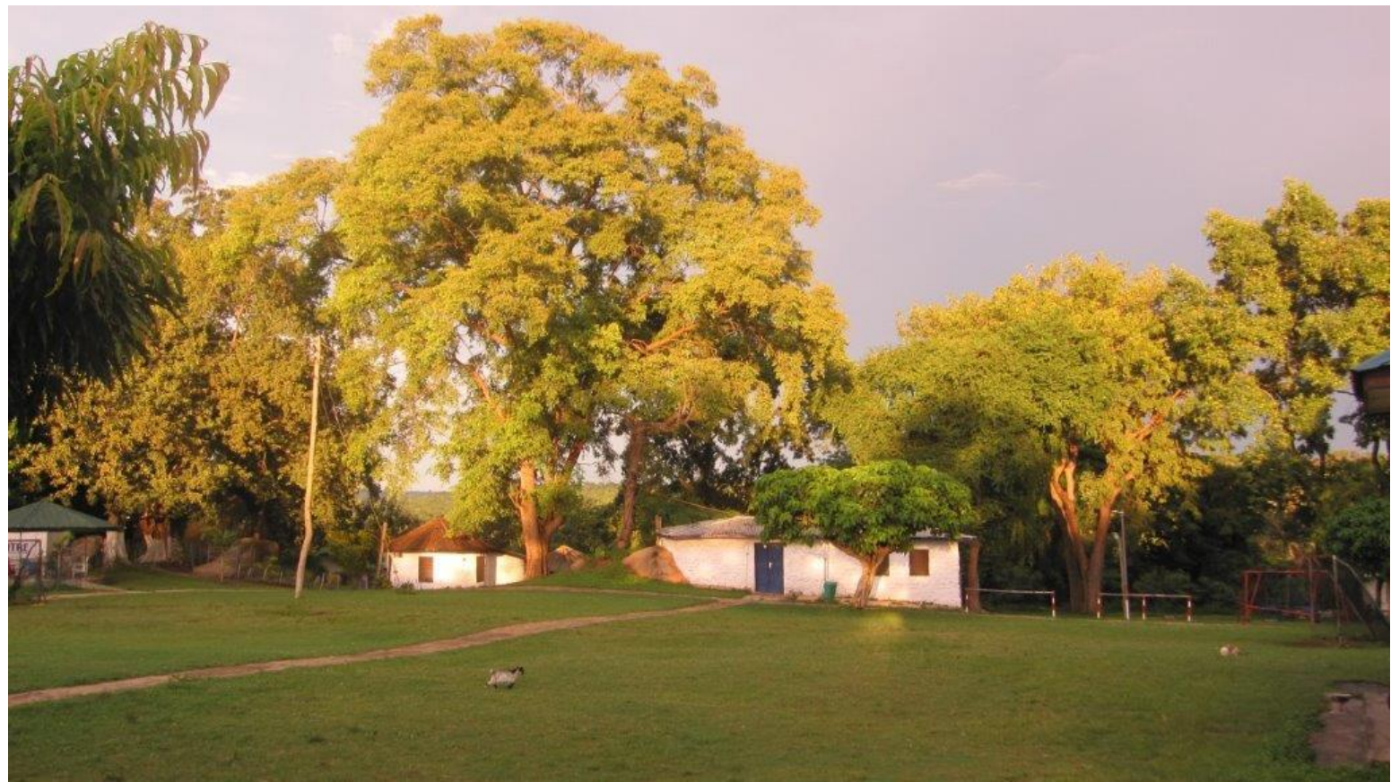
The very beautiful PCC compound

Email: handinhandcommunity@gmail.com Website (English): www.handinhandcommunity.com Website (Dutch): www.operationhandinhand.nl