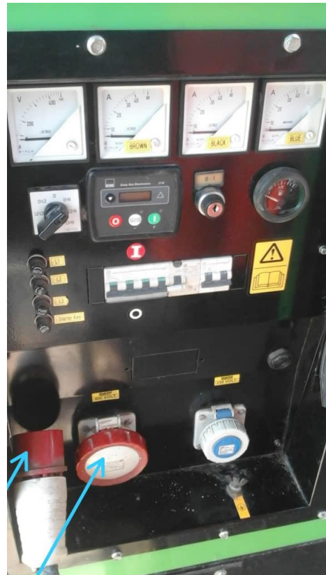
Here was the problem!

That is why we will be more dependent on our own generator for the time being. So we took a fright when a connection melted a while ago.