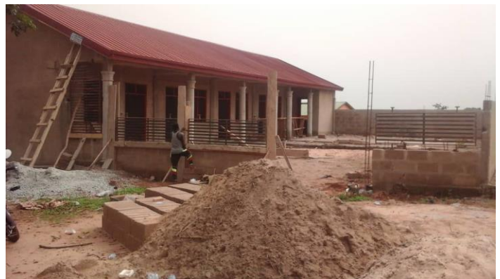
New day care building in Nkoranza

For the year 2020 we are planning a few very important developments, some of them are already in full progress. Perhaps the most important one is the realisation of a wonderful building for Day Care down town Nkoranza. In the near future children with disabilities will be able to spend their days here while their parents can go to work.