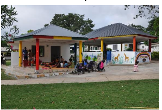
Physio Place and Noah's Ark

The new centre of the Community consisting of three wonderful buildings namely the Royal Community Hall, Noah's Ark and the Physio Palace were officially opened in October. These festivities were accompanied with much pleasure and gratitude.