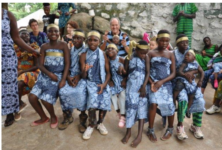
9 children baptized in 2015

Despite this problem we were still happy to welcome quite some visitors to our Community in 2015. They stayed in our Guesthouses, some for one day, others much longer. Almost without exception all visitors are very positive and impressed by the atmosphere and the good care provided at Hand in Hand. It has been like that over the years and obviously the Spirit of PCC is also touching many visitors!