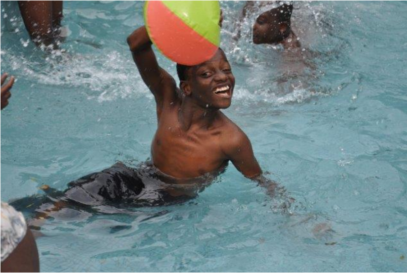
Sadat in the pool

We loyally adhere to a precise daily routine so that the children may feel safe. A good and predictable structure is a very important cornerstone for our Community.