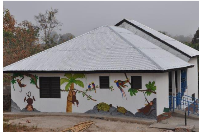
The 2015 G8 house