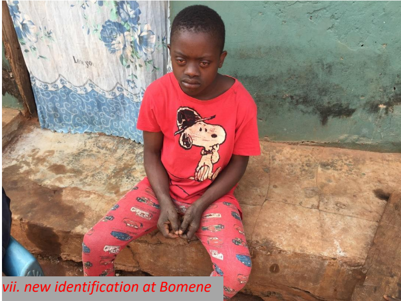
vii. new identification at Bomene

The outreach team undertook an identification drive in the first three months of 2022 in two communities: Bomene in NKoranza north and Forikrom in the Techiman south municipality. In all, a total number of twelve clients were identified and registered. Some of the clients have multiple disabilities and others have single disability.