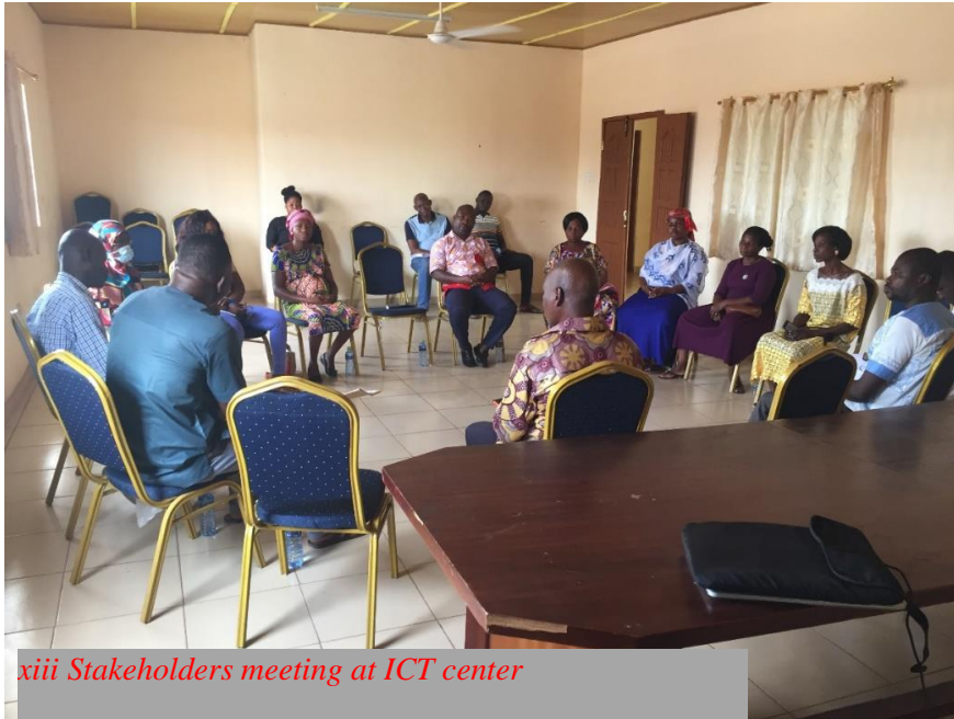
xiii Stakeholders meeting at ICT center

In the month of February, two members of the outreach team attended a one-day stakeholders meeting organized by Inclusion Ghana for various state and non-state institutional heads. The purpose of the meeting is to foster synergy in the various activities of the institutions for the ultimate good of persons living with intellectual and developmental disabilities and their parents and caretakers.