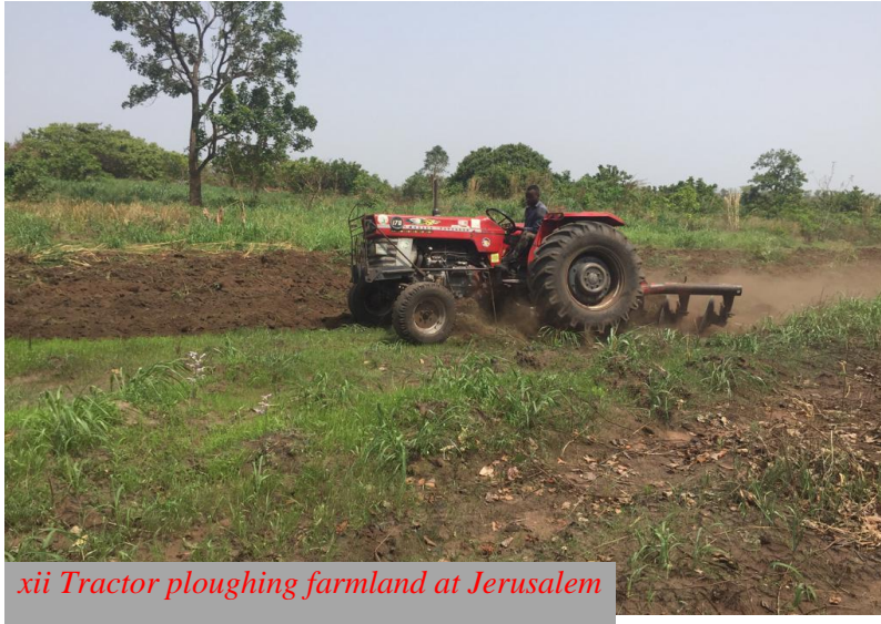
xii Tractor ploughing farmland at Jerusalem

After the first phase of the farming project failed at Donkro Nkwanta last year, the team has made frantic effort to make the project rebound. The failure was occasioned as a result of land dispute and the lack of commitment of parents. During the first quarter of 2022, the team has been able to acquire a one-acre land at Jerusalem where the