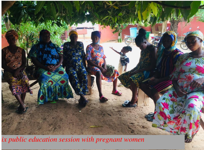
ix public education session with pregnant women

During the period of reporting, the outreach team embarked on public education and awareness drive in a number of health centers and Community Health Planning Services (CHPS) facilities in both Nkoranza south and north districts. Some of the facilities include: Ayerede health center, Africa Libra, Salamkrom Health post, pinihini Health